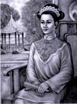
( Princess Hang Li Po )

In 1459, the Mansur Shah of Malacca married Princess Hang Li Po from Ming Dynasty China. She travelled with an entourage of 500 ministers, courtiers and learned people who formed the first wave of Chinese immigration in Malaya. The descendants of their subsequent intermarriages with the indigenous people became known as Peranakans.