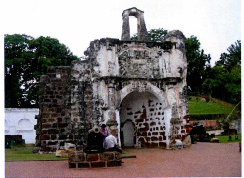
( "Porta de Santiago" )

In 1459, the Mansur Shah of Malacca married Princess Hang Li Po from Ming Dynasty China. She travelled with an entourage of 500 ministers, courtiers and learned people who formed the first wave of Chinese immigration in Malaya. The descendants of their subsequent intermarriages with the indigenous people became known as Peranakans.