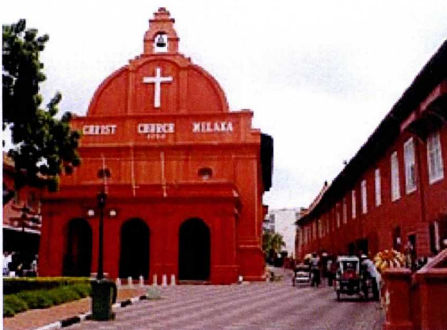
( "Christ Church" )

The Portuguese settled in 1511, promptly building the " A Formosa " fort. The gate house " Porta de Santiago " is the earliest colonial building in Asia still standing.