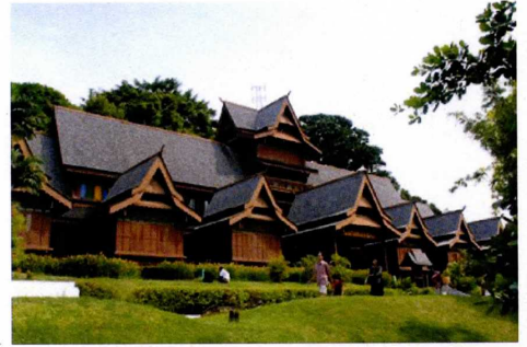
( Replica of Sultanate palace )

Melaka (Malacca) has a colorful history as a melting pot. The Sultanate was formed in 1400. As a bustling entrepôt, Malacca emerged as a center for Islamic learning, dissemination and development of the Malay language. The famous Chinese explorer, Admiral Zheng He came to Melaka in 1405 and used it as his base for South East Asian exploration and trade.